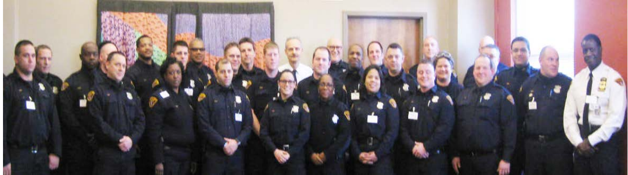
41 Cleveland Police Officers and a Dispatcher graduated from the ADAMHS Board CIT Training on February 13, 2015.

◆Our training is based on the nationally recognized Memphis Crisis Intervention Team model. ◆Involvement in the 40-hour CIT Training is voluntary and the Board offers the training free of charge.